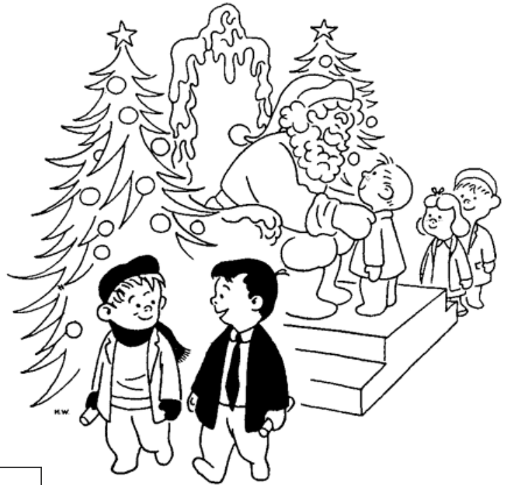
"I detected a new note of sincerity in his Ho! Ho! Ho! I think he's off the sauce."

Copyright ©1944-2008 The A.A. Grapevine, Inc.