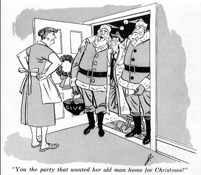
"You the party that wanted her old man home for Christmas?"

"Call before you drink and I will help you stay sober. Call after you drink and you will help me stay sober."