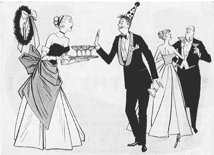
"No more for me, thanks, I have to drive to three more parties."

Policeman: "No, sir, it does not. But this one was trying to roll up the white line!"