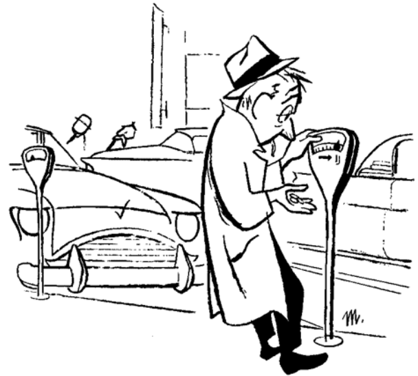
"Down to sixty . . . my gawd, I've lost a hundred pounds!"