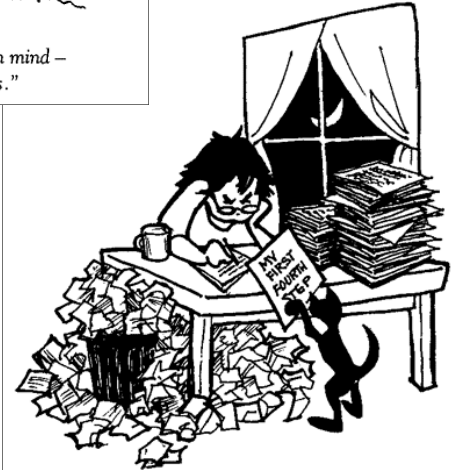
"Rigorous honesty... rigorous honesty... rigorous honesty..."