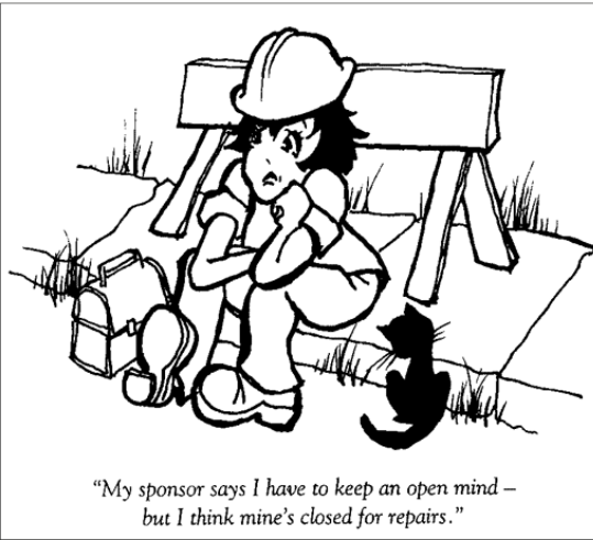
"My sponsor says I have to keep an open mind – but I think mine's closed for repairs."

Liquor doesn't drown your troubles--it only irrigates them!