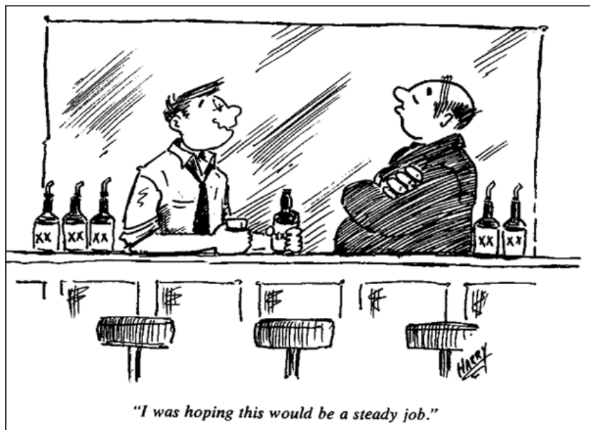
"I was hoping this would be a steady job."

Copyright ©1944-2010 The AA Grapevine, Inc.