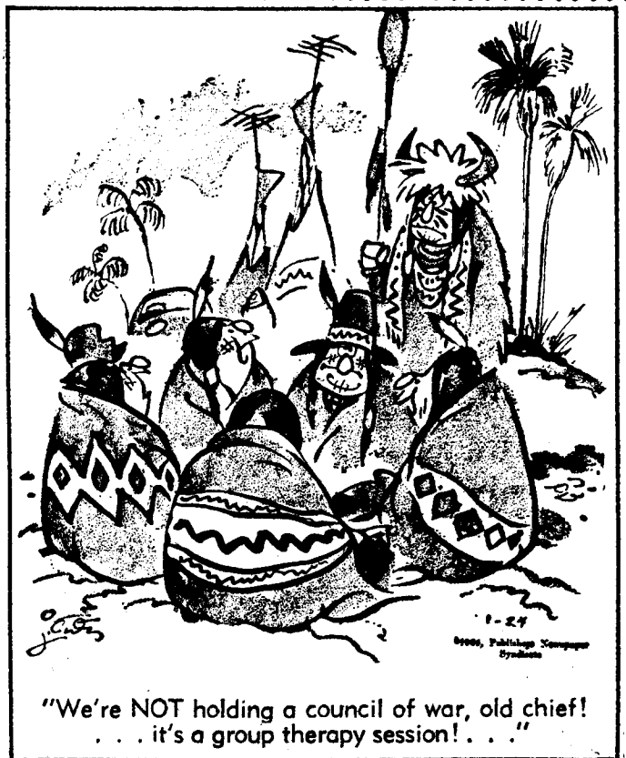
"We're NOT holding a council of war, old chief! . . . it's a group therapy session! . . ."

For further information call your Central Office in Orange County- 542-7217.