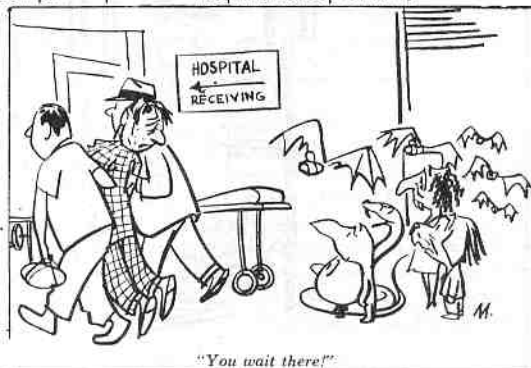
"You wait there!"