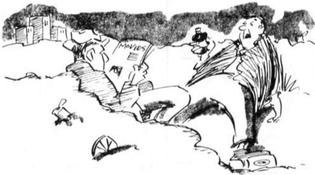
"Days of Wine and what?"