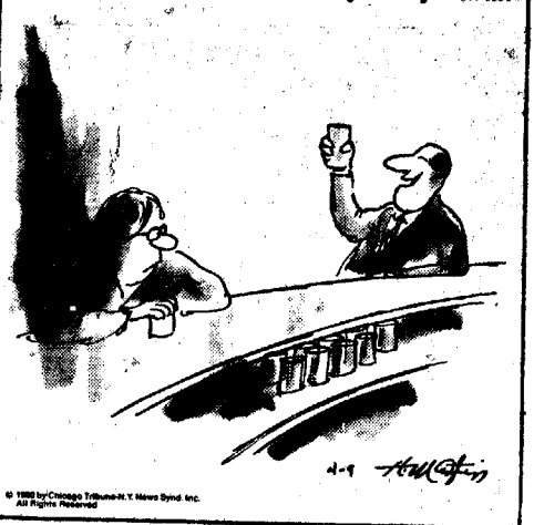
"To Perrier, women and song!"