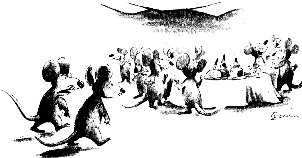
"Oh, Lord! Not another wine-and-cheese party."