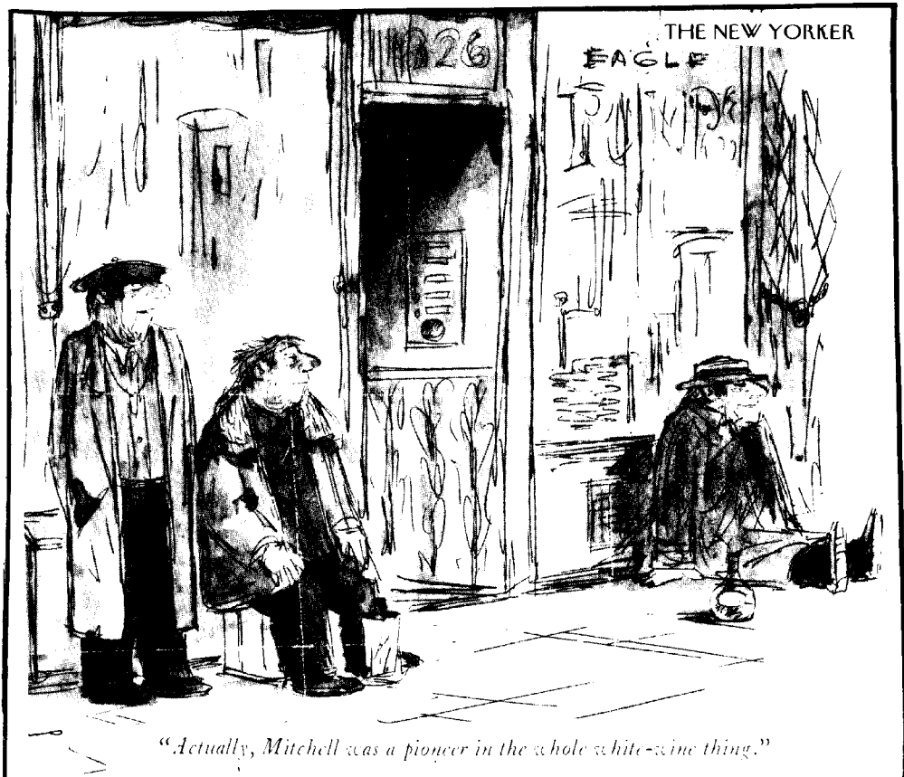
"Actually, Mitchell was a pioneer in the whole white-wine thing."

ON A PRISON FARM.... They say that a drink is no harm done But I'm here to say that it's just begun There comes a time, when you will say If I can drink just one, I'll make it thru the day. But your day turns to night, and some how you say If I can have one more, I'll be on my way. So you order up and sit right down And four hours later, you're still around. You look at your watch, and it seems to say I think it's best you're on your way. So you stumble out, and look for your car And when you've spotted it, you know it's not far. You stagger over and hop right in, And now you figure you can win. Your hands are not steady and your vision is blurred, When you suddenly realize, That you pulled to the curb. There's a flash in your face and a click of your wrist And now you realize, you could not have won. The odds you were playing were a million to one, So those who say, "One will notharm" Has naver done time on a prison farm.. .....Robert L. Chino Prison, Chino.