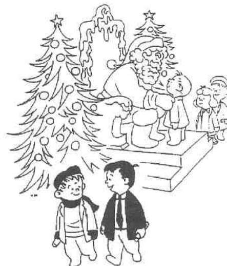
"I detected a new note of sincerity in his Ho! Ho! Ho! I think he's off the sauce."

50th Anniversary Convention of AA in Great Britain Wintergardens, Blackpool, England For info: The Registrar, Great Britain Convention 1997, P.O. Box 32, South Shore, Blackpool FY4 2UA England